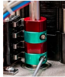
Fig 6 - CCW EOT Cam adjustment

This completes the calibration of the actuator.