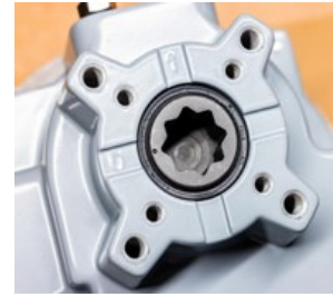
Fig 1 - Bottom view of actuator showing the "0" mark (Closed [CW] position), the "1" mark (Open [CCW] position), and the dimple reference. The actuator is shipped from the factory in its fully CLOSED position.

b. Using a 2.5mm hex key on CAM #1 (Fig 6), loosen the cam set screw and rotate the cam CW by pushing the hex key to the LEFT a few degrees. Lightly snug up on the set screw until resistance is felt against the cam