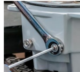
Fig 2 - Right side (CW) mechanical stop