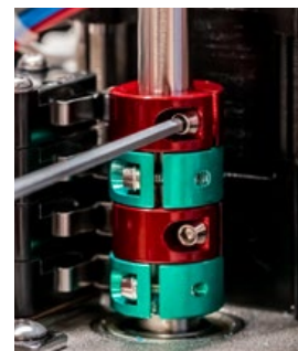
Fig 5 - CW AUX Cam adjustment