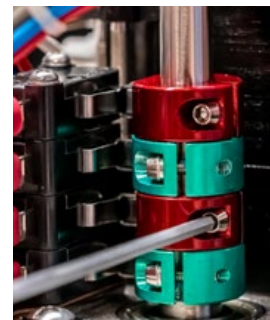
Fig 4 - CW EOT Cam adjustment