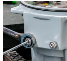
Fig 3 - Left side (CCW) mechanical stop