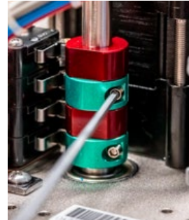
Fig 7 - CCW AUX Cam adjustment