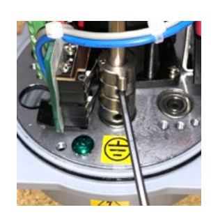
Fig 5 - CCW AUX Cam adjustment