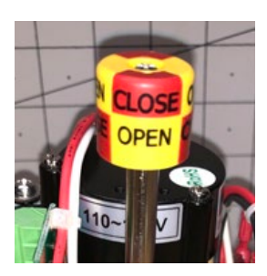
Fig 1 - 3D position indicator identifies the rotation angle of the actuator.

This completes the calibration of the actuator.