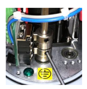
Fig 2 - CW EOT Cam adjustment