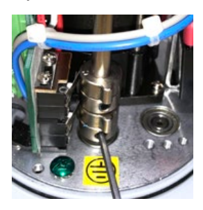
Fig 4 - CCW EOT Cam adjustment