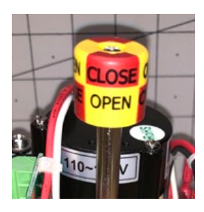
Fig 1 - 3D position indicator identifies the rotation angle of the actuator.

If this actuator has left the Max-Air factory as a valve assembly, the analog response has already been calibrated and should require no adjustments. Should another calibration be needed, proceed cautiously with the following steps: