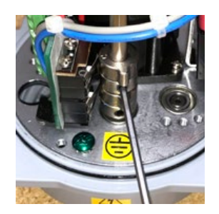
Fig 5 - CCW AUX Cam adjustment