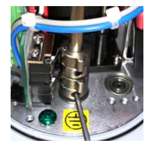
Fig 4 - CCW EOT Cam adjustment