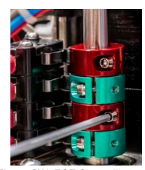
Fig 4 - CW EOT Cam adjustment