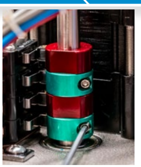
Fig 6 - CCW EOT Cam adjustment

This completes the calibration of the actuator.