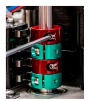
Fig 5 - CW AUX Cam adjustment