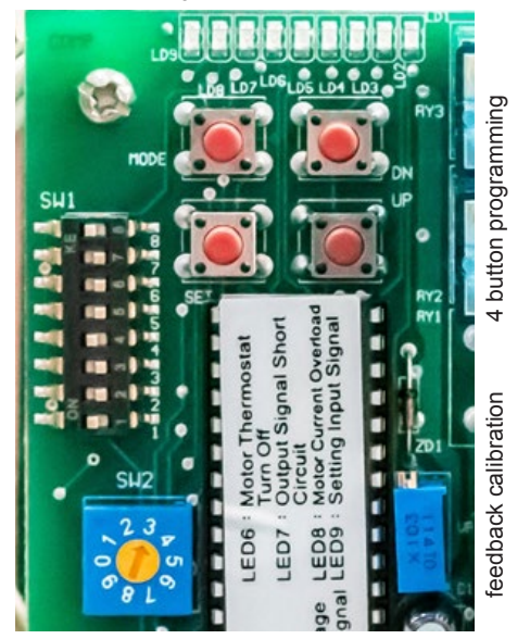
Fig 8 - Analog Settings