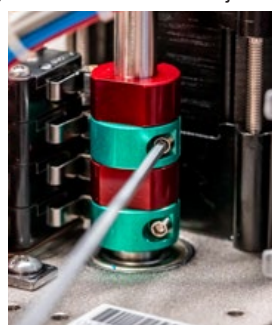
Fig 7 - CCW AUX Cam adjustment