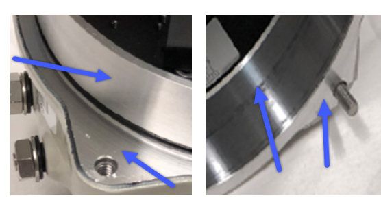
Fig 1 - Flame paths - Do NOT scratch, mar, dig or otherwise damage these surfaces!

b. Using a 2.5mm hex key on CAM #1 (Fig 5), loosen the cam setscrew and rotate the cam CW by pulling the hex key to the LEFT a few degrees. Lightly snug up on the setscrew until resistance is felt against the cam shaft. Pull the hex key to the RIGHT SLOWLY until you hear a "click" from the associated (#1) cam switch and snug up on the cam setscrew. Do not move the actuator. Do NOT overtighten the cam setscrew.