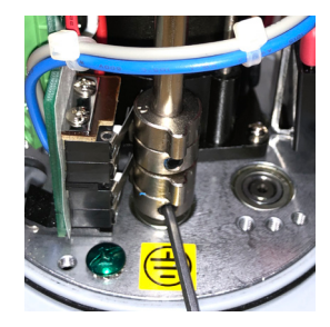
Fig 5 - CCW EOT Cam adjustment

This completes the calibration of the actuator.